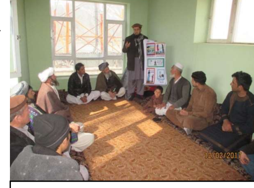
Community Awareness on Hygiene

The direct beneficiaries of this project are GBV survivors, perpetrators, religious leaders, community elders, youth, boys, girls, men and women of host and displaced communities.