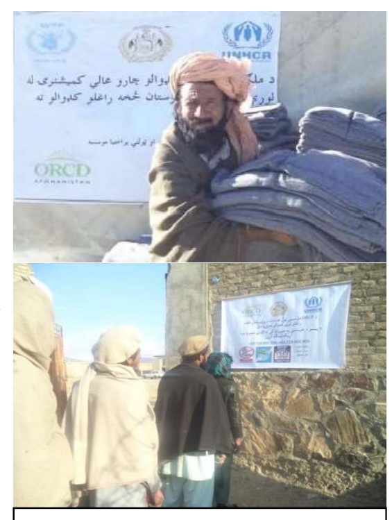
Winter assistance distribution to Refugees

ORCD Main Office was involved in handling beneficiary grievances and complaints received through the hotline it established during the whole process of distribution.