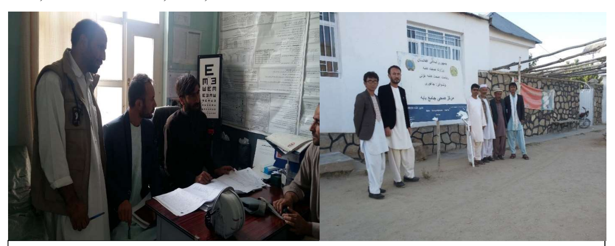
ORCD and GCMU's Senior Staff during a Supervision Mission visiting Health Facilities in Ghazni

The primary target population of this project are pregnant women and children under five years of age. Though, the entire population in the target areas is able to receive basic health services through Health Posts, SHCs, Prison Health Center, BHCs, CHCs and CHC+.