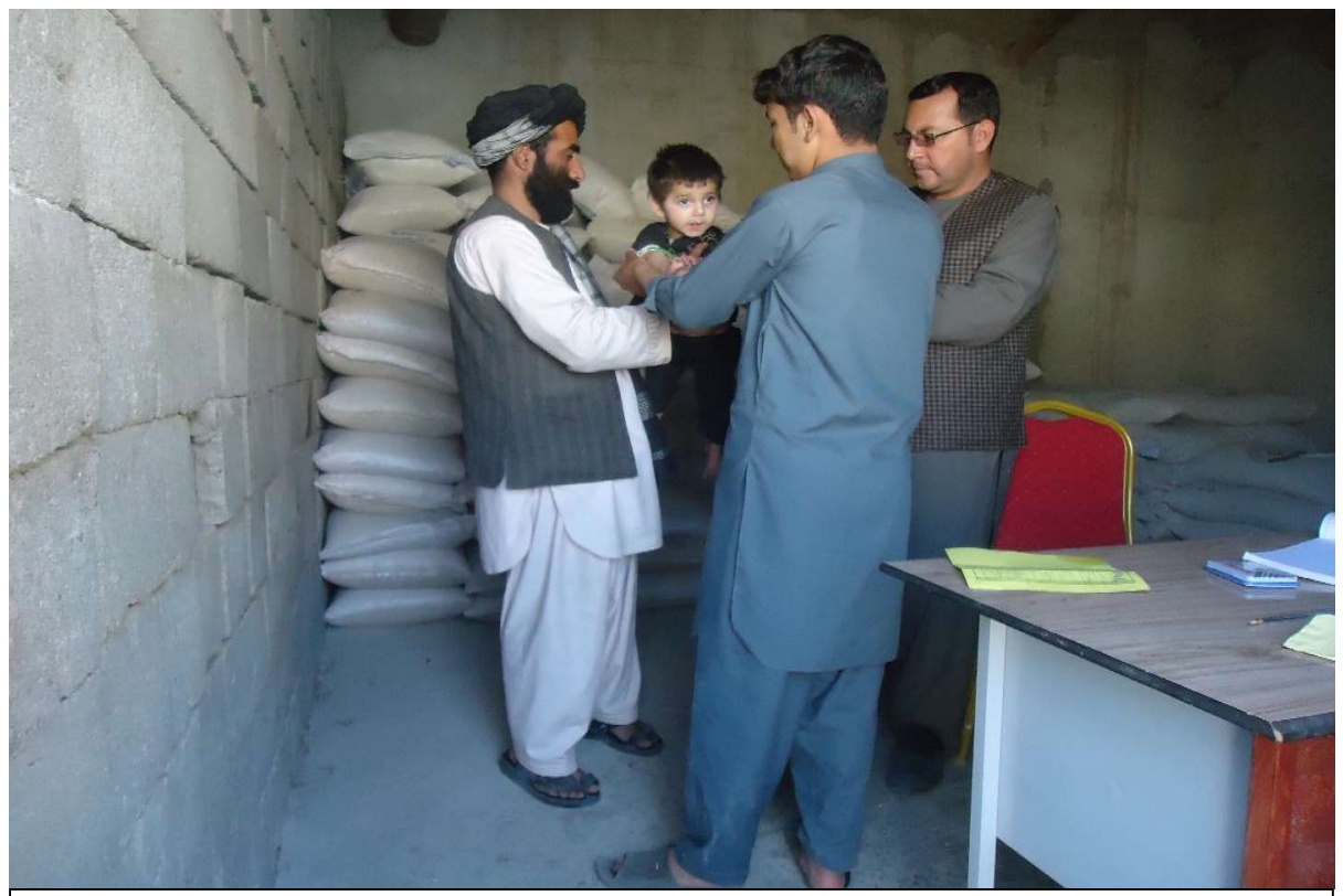
ORCD Nutrition Officer and Distributor seeing and recording a malnourished boy followed by distribution of supplementary food in the distribution point

Moreover, WFP's Project Assistance Team undertook several surprise monitoring visits from ORCD's warehouses, distribution points and distribution processes. Therefore, ORCD developed follow-up action plans in the view of WFP/PAT findings subsequent to receiving reports on findings/areas for improvement. The follow-up action plans were implemented timely and the results were communicated to WFP Kabul Area Office subsequently.